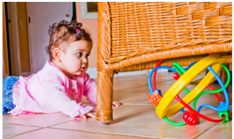
How does it feel to find something you thought was lost?

Make a sheep. Stuff an old, single-coloured sock with anything to hand. Use an elastic band to close it at the open end, leaving a little stumpy tail. Use another band to section off a bit of the toe end to make a head. Give it eyes, a nose and mouth with a felt pen, or some stitches. Group 12 cocktail sticks into threes and bind each three with tape or wool to make four legs. Stick the ends into the sheep. You could trim the sharp feet ends for safety. Once you have your sheep, it might help you to wonder a bit: I wonder what the sheep felt when it was lost. I wonder what it felt like to be found. I wonder how the shepherd felt.