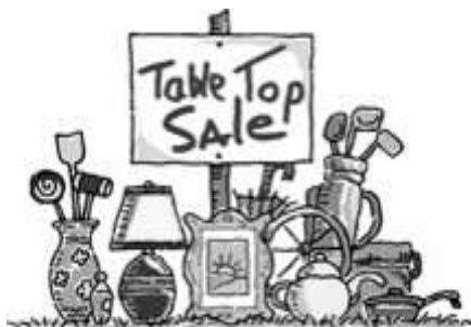
Table Top Sale Saturday 27th May

12.00 noon till 2.00 pm in the Main Hall Bric-a-brac, cakes, clothes, bags, refreshments and lots more!