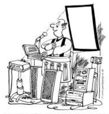
... and the theme of this morning's service is... 'Preaching a Gospel of Simplicity'...